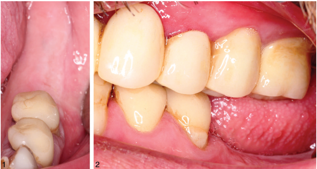
FIGURES 1 AND 2. FIGURE 1. The patient presented with an edentulous mandibular left. FIGURE 2. There was loss of vertical bone.

esthetics (Figure 5). After the patient's approval, the definitive splinted crowns were cemented with resin cement (Maxcem Elite, Kerr) (Figure 6). The tissue level zirconia margins are kept clean with daily