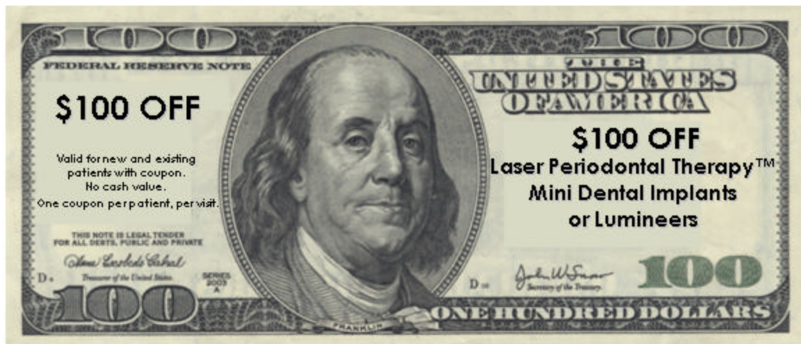
For that Million Dollar Smile